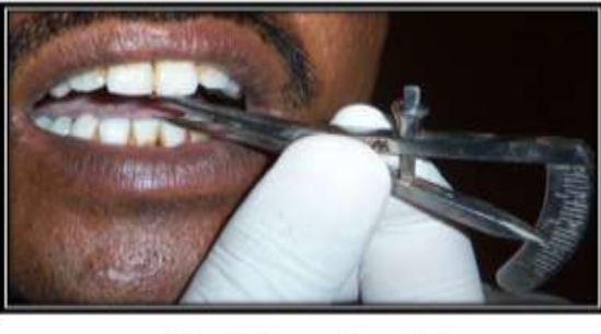
Figure 1a: Pre-operative mouth opening

position either by direct rotation or tunnelling under the surrounding tissues once it has been dissected free of the surrounding tissues. The graft was then secured with 4-0 vicryl suture material (jhonson&jhonson LDT.)Ryle's tube was passed and secured.