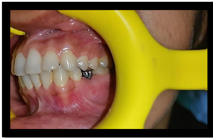
Figure 6- Metal Try- In Verification In Patients Mouth