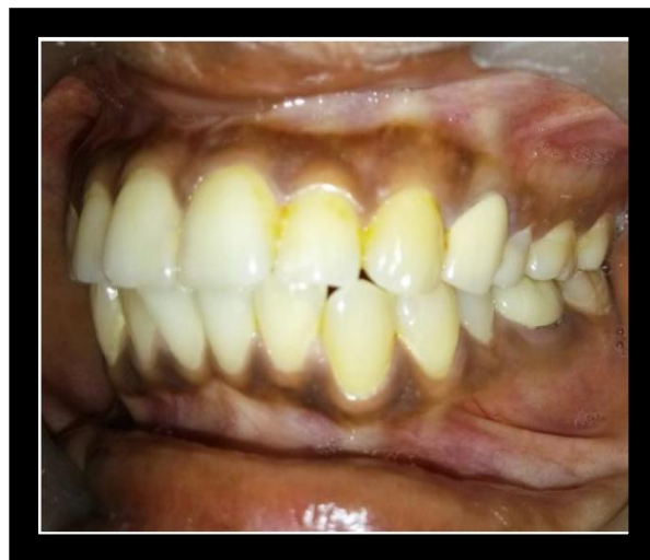
Figure 7- Porcelain Fused Metal Crown Fabrication and Evaluated Intraorally.