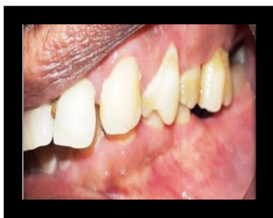
Figure 1- Patient With Limited Interocclusal Space