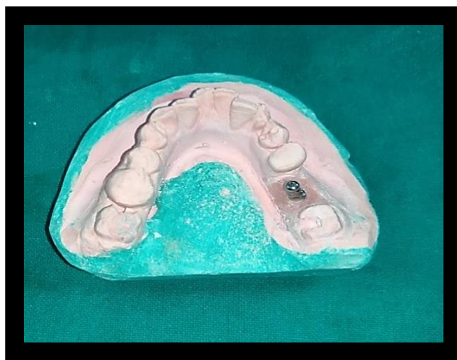
Figure 4- MastercastRetrived With Impression Coping.