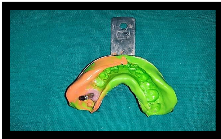
Figure 3 Impression Made With Addition Silicone (Putty And Light Body Consistency) And Gingival Mask Applied