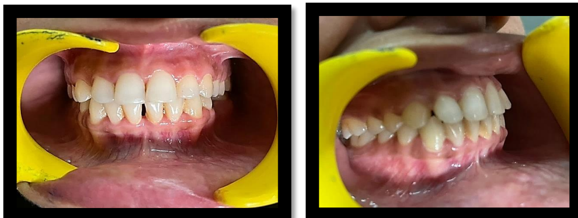
Figure 8- Occlusion After Screwing The Final Prosthesis.