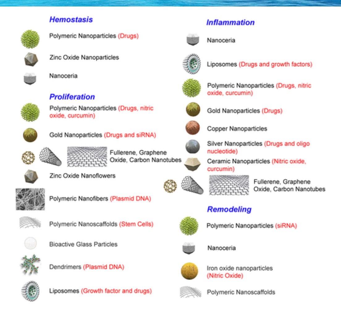
Fig 3: Diagrammatic evidence of therapies based on nano-technology used in wound healing [33]